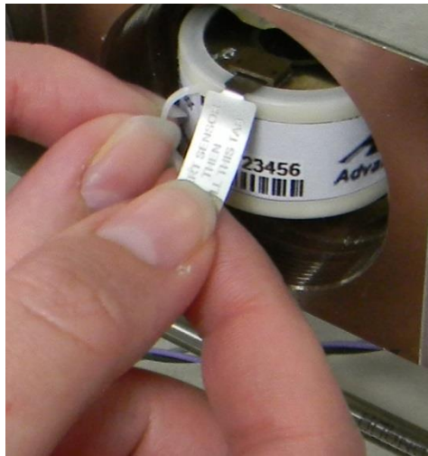
Figure 5. Inserting sensor in cell block

Dispose of leaking or used sensors in accordance with local regulations. Sensors usually contain lead which is toxic, and should generally not be thrown into ordinary trash. Refer to the MSDS to learn about potential hazards and corrective actions in case of any accident.