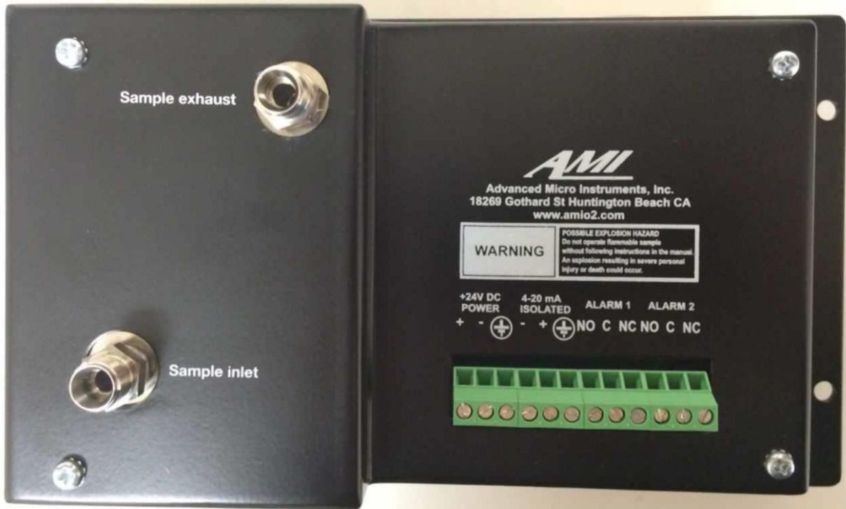
Figure 1. Back panel of 2001LC analyzer