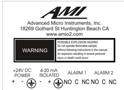
Figure 3. Back panel screen print of the 2001LCS.